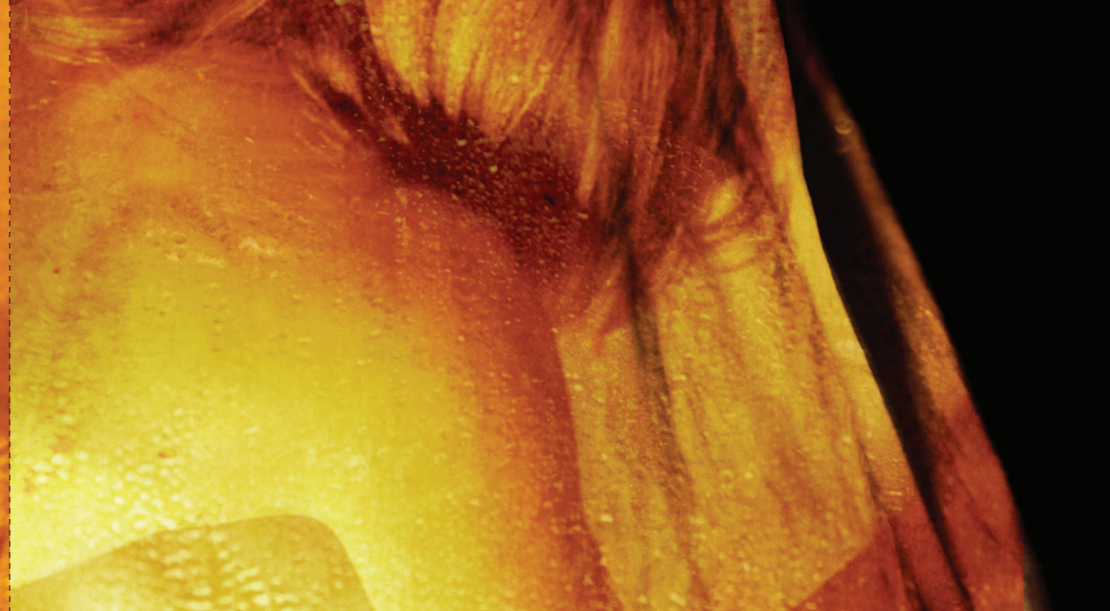
Zlata zavesa 12 / Golden Curtain 12, 2016, inkjet print on metal, 56 x 100 cm