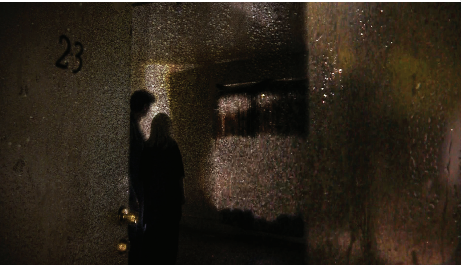
Hotelski dnevnik / Hotel Diary, Soba 23 / Room 23, 2016, inkjet print on metal, 90 x 150 cm