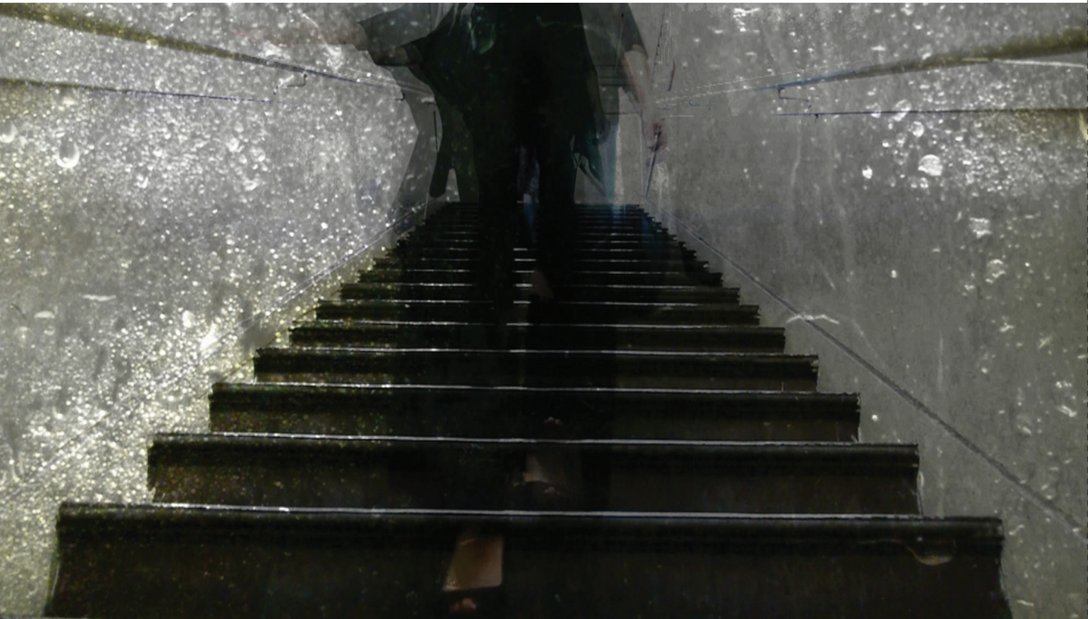
Hotelski dnevnik / Hotel Diary, Stopnišče 1 / Staircase 1, 2016, inkjet print on metal, 90 x 150 cm