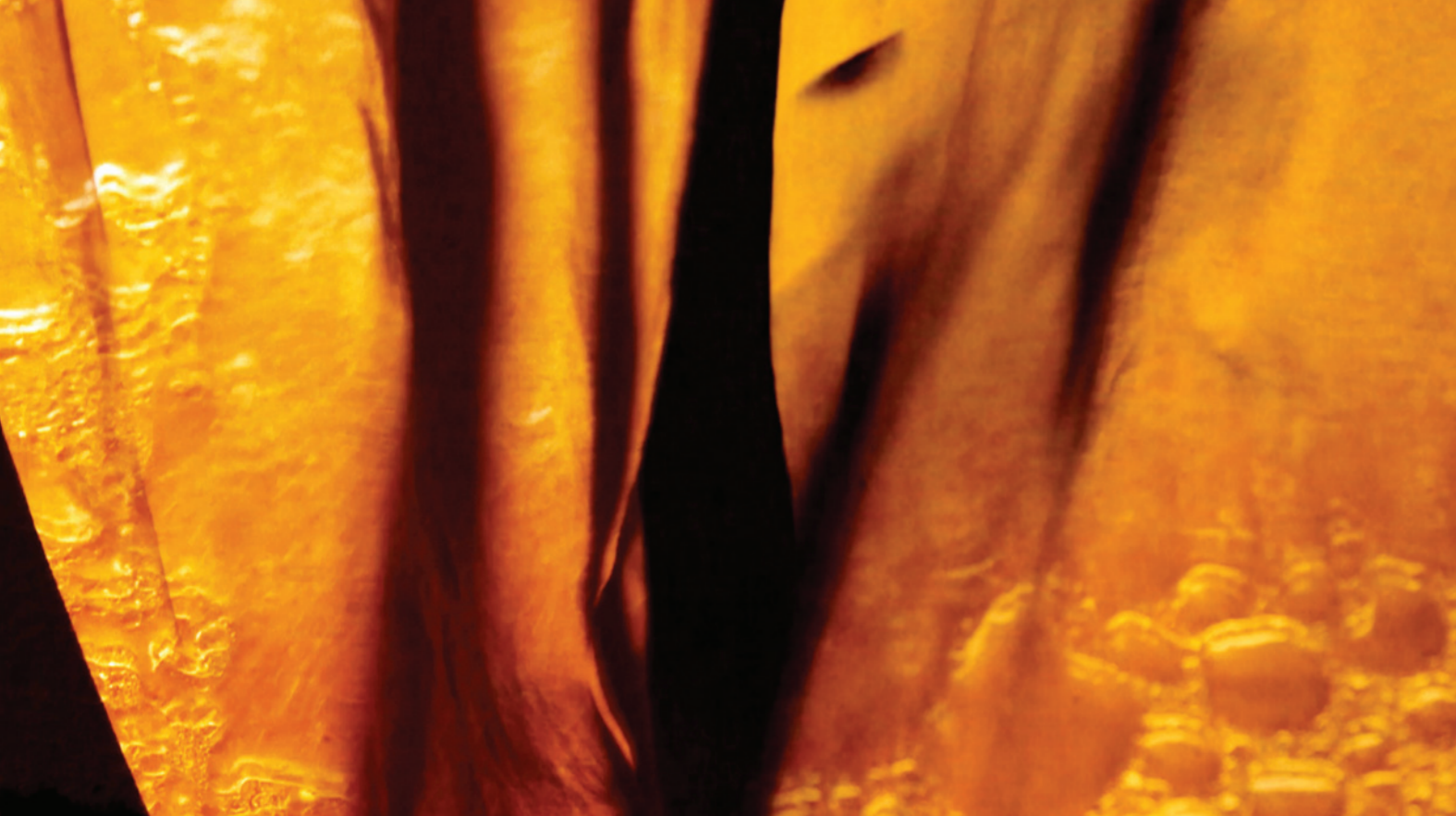
Zlata zavesa 9 / Golden Curtain 9, 2016, inkjet print on metal, 56 x 100 cm